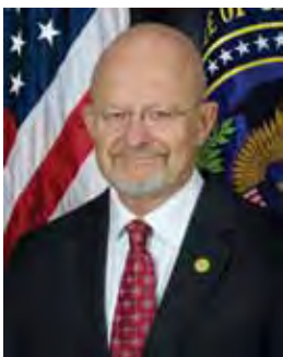
James R. Clapper

Mr. Clapper is a Former Director of National Intelligence and one of the finest intelligence minds of the 21st Century, serving for seven years under President Obama.