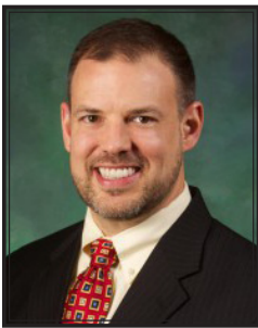
About the Author:

As for the leases... take a close look and make sure that the rental value is objectively accurate. If you pay rent at $15 per square foot, you better be charging $15 per square foot. Another take away from this decision is the lease better be for a defined space; i.e. an office. If your business model is to support an open floor plan, leasing space to a mortgage broker or title company is probably a dangerous row to hoe.