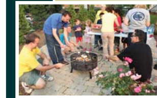
An Opportunity to be a Role Model!